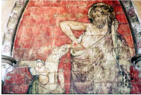
The Painting of 'Doubting Thomas' in Westminster Abbey c. 1270–1300

Bearers of the Cross Material Religion in the Crusading World, 1095–c.1300